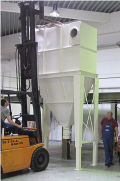
1 Big-bag emptying station